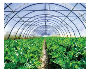
Greenhouse, Nursery, Sod