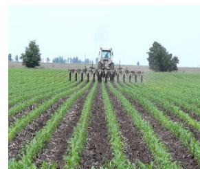
Cultivation, Preparation of Soil