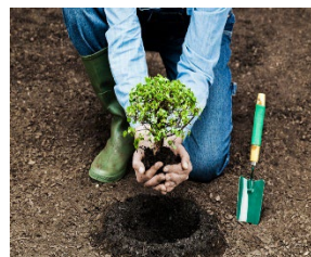
Trees- Planting, cutting