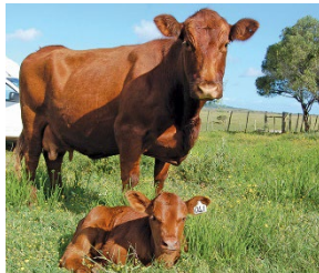
Feed Cattle, Processing, Packing