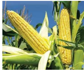
Harvest (Vegetables & Fruit)